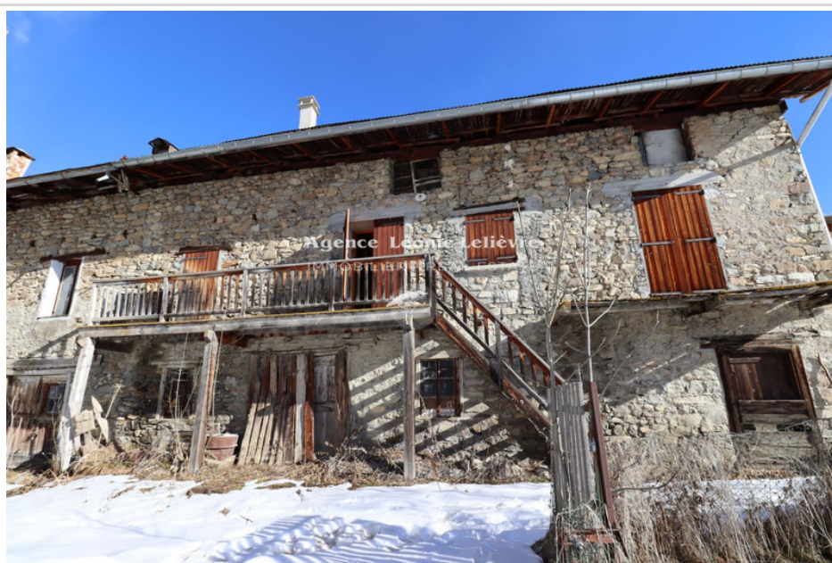
Farm Allos - Ref. V3329M - Mandate n°2361

Large farm of 385m2 on three levels, to renovate with a very beautiful open view, lots of sunshine and great potential to create one or more accommodations. It already has on the 1st level a T2 apartment of 41m2 with more recent layout and which can be habitable quickly with a simple refresh. The potential of this farm lies in its huge attic and its beautiful framework, its ground floor on one level overlooking the garden and the 1st level has balconies in the sun. It is located on a plot of 351m2 and has a garden. Located in La Foux village, you are 4 minutes from the La foux Espace Lumière station and 12 minutes from the village of Allos. You are at the gates of Mercantour and Lac d'Allos and you can enjoy very beautiful hikes. Cyclists will enjoy climbing the Col d'Allos. La Foux is located 2h30 from Nice, 3h30 from Toulon and Marseille.